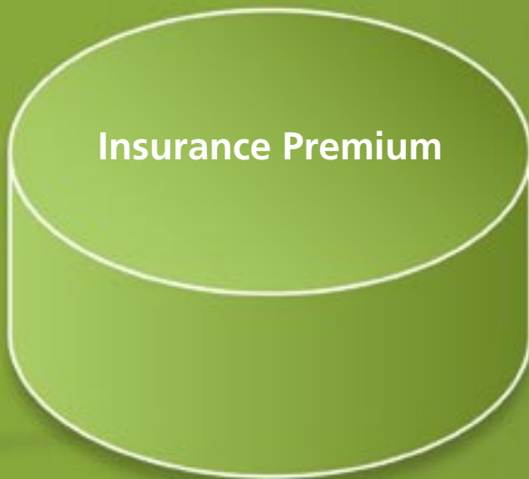
Traditional Health Plan